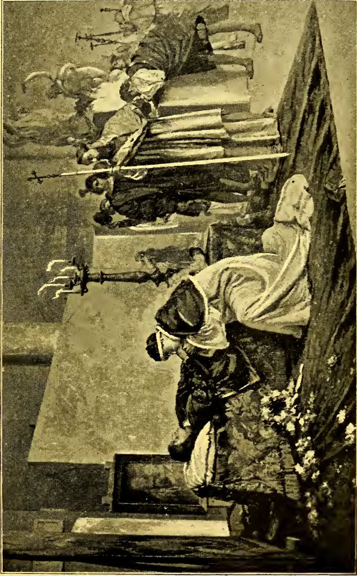
LEO X. AT THE BIER OF RAPHAEL.